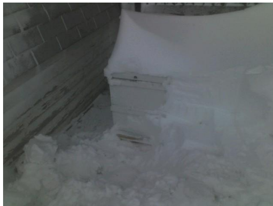
1 Snow packed beehive after the Christmas Blizzard "09" in Polk, Nebraska