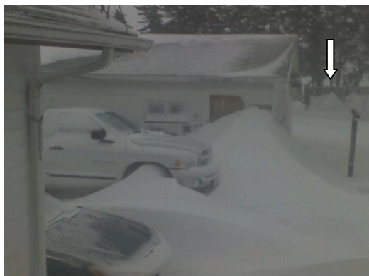
2 Hives nearly covered by the Christmas snowstorm in Polk Nebraska

*** Special rates on “Bee Culture” and “American Bee Journal” with membership to the state association.***